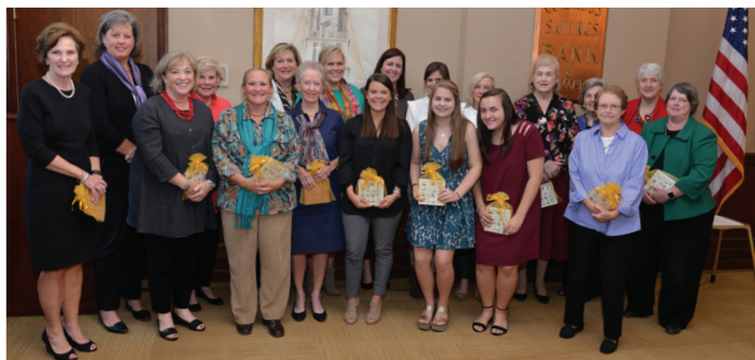
Historic Columbus' wonderful volunteers!